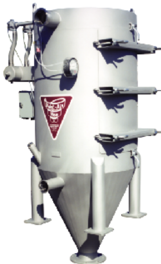
WhirlAir Stainless Steel High Vacuum Design (with hopper)